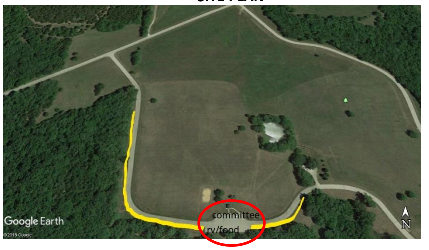
* * FOOD * *

Breakfast and lunch will be available at the field from a local Food Truck.